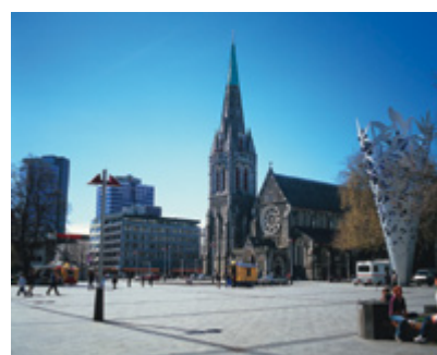
Cathedral Square